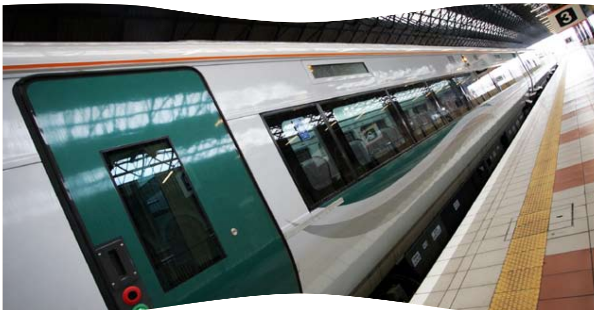
Iarnród Éireann's new Intercity railcars, which entered service on the Sligo/Dublin line in December 2007.

The record investment programme in Iarnród Éireann's network and services continued to pay dividends in 2007, with yet another record set for the highest ever number of passenger journeys recorded, 45.5 million journeys. Other features were: