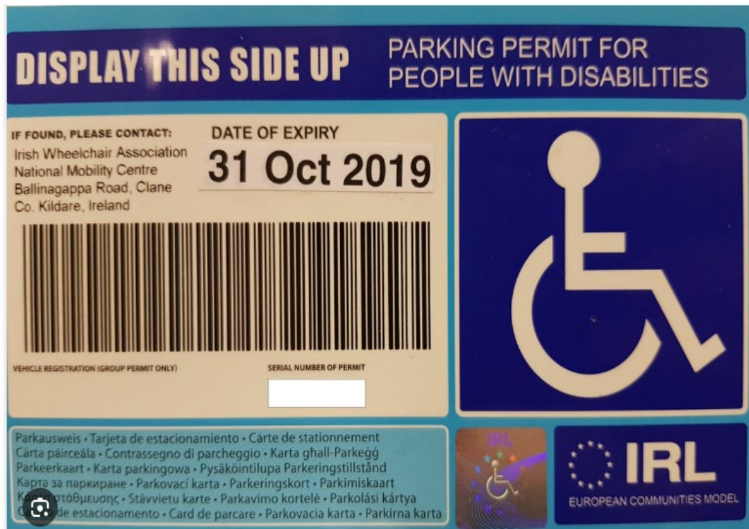
Pictured above Car Park Blue Badge Permit and Picture of disability parking space at Kent station in Cork.