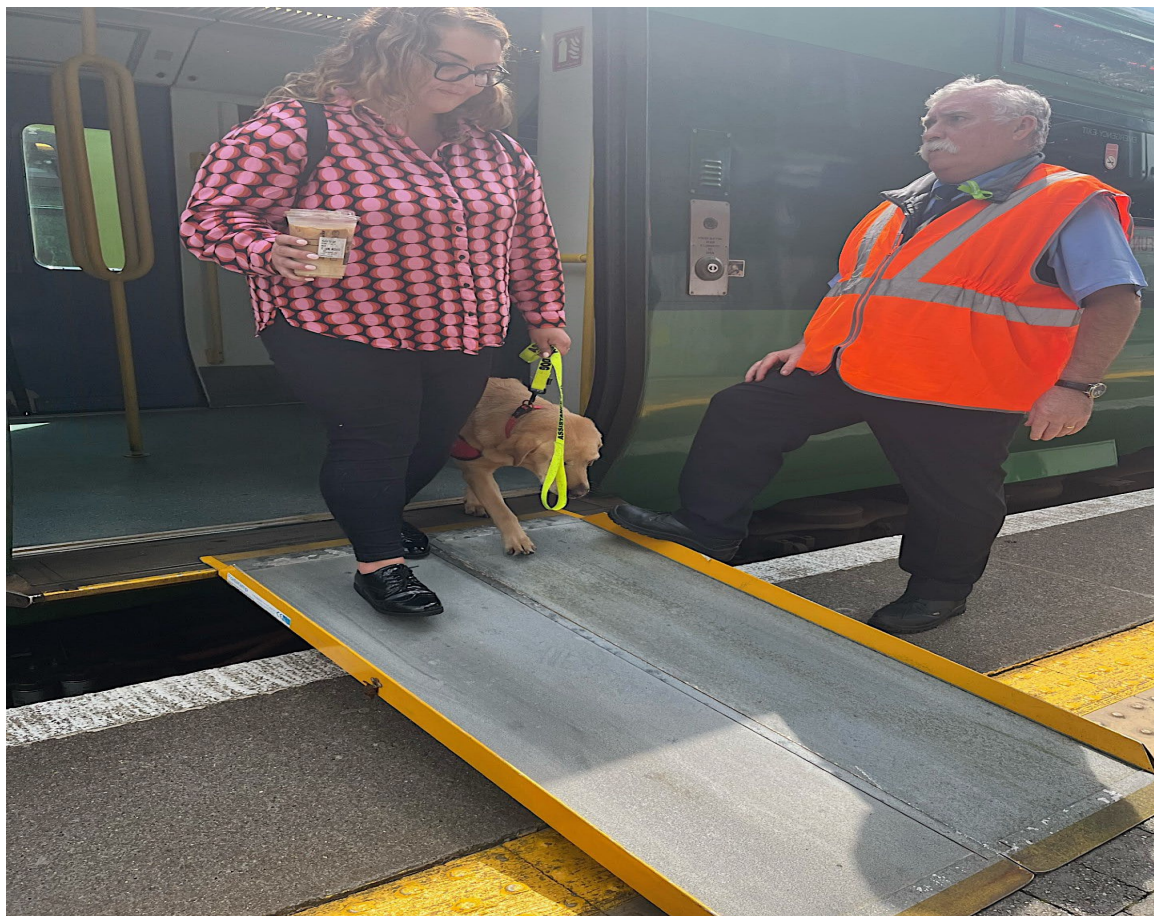
Picture above of customer using ramp assisted by staff member.

Our staff will use ramps to help you on or off our trains as required.