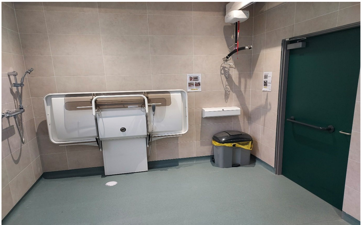
Picture above of Changing Places at Heuston station, Dublin.

There are three Changing Places facilities currently on the Iarnród Éireann network. Connolly Station, Dublin 1, Heuston Station, Dublin 8 and Colbert Station in Limerick with plans for further installation in Sligo and Athlone. All facilities are managed through the Station Cleaning staff who will open, close and clean the facility.