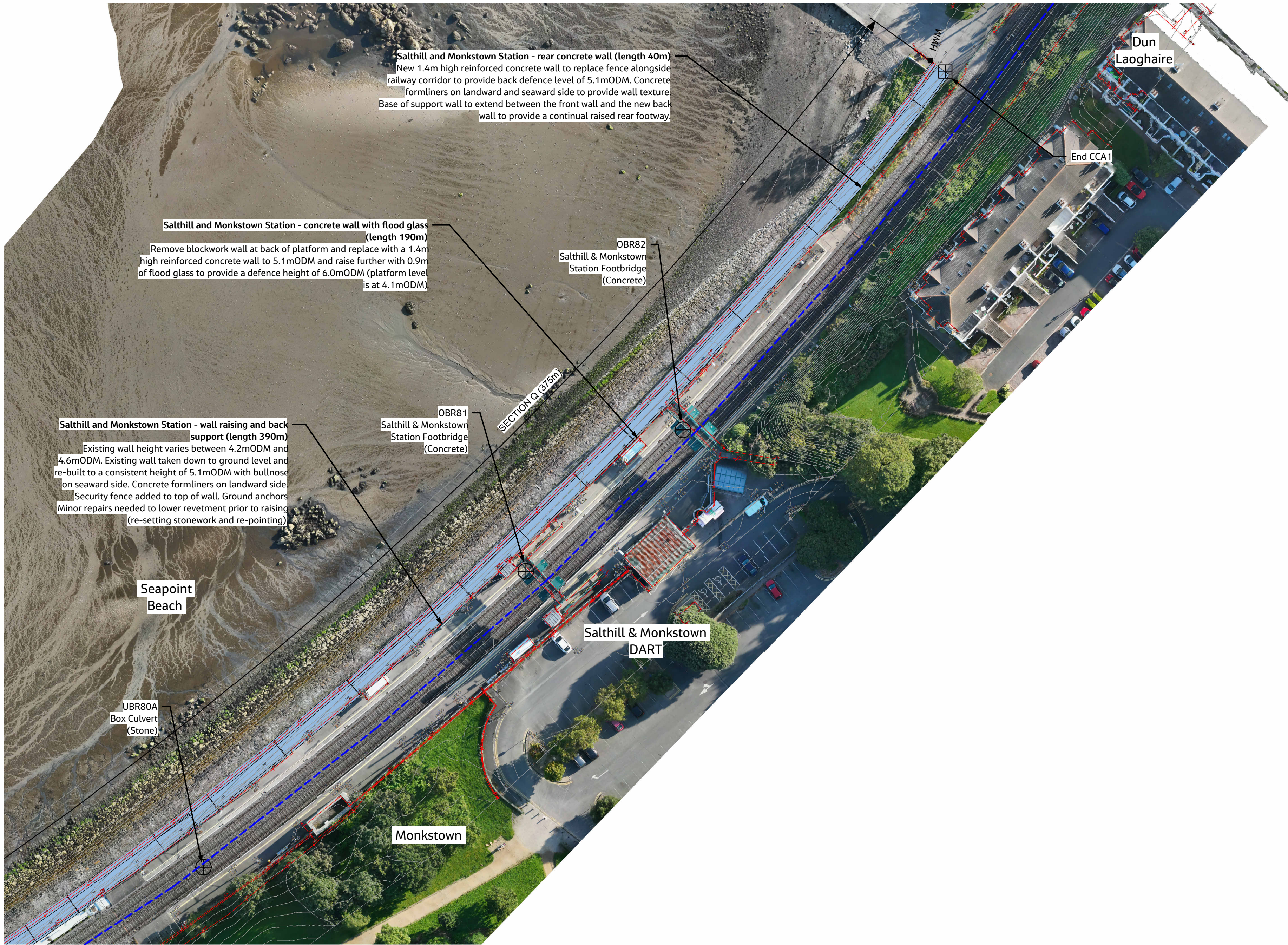
CCA1 - PLAN - PART 14 SCALE 1 : 500