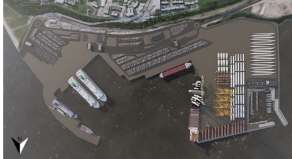
Overhead view of the proposed ORE hub development, in the context of the ongoing Terminal 7 and Rosslare Europort access road projects within Rosslare Europort.

Since 2022, Rosslare Europort has been working with specialist ORE experts and advisors on feasibility and concept designs. Having collated various preliminary data, the project team developed initial design concepts, which were presented to the public and various stakeholders in December 2023. Further improvements to the initial designs have been completed and are currently being presented to stakeholders.