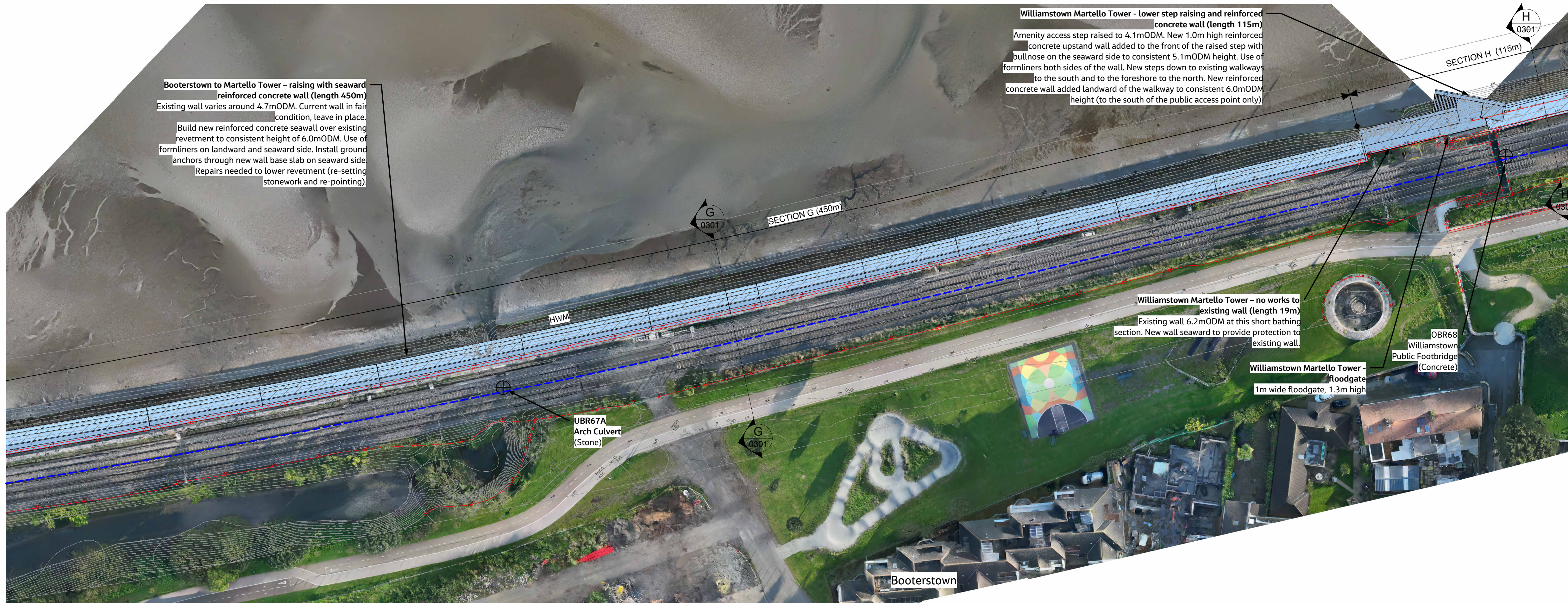
CCA1 - PLAN - PART 5 SCALE 1 : 500