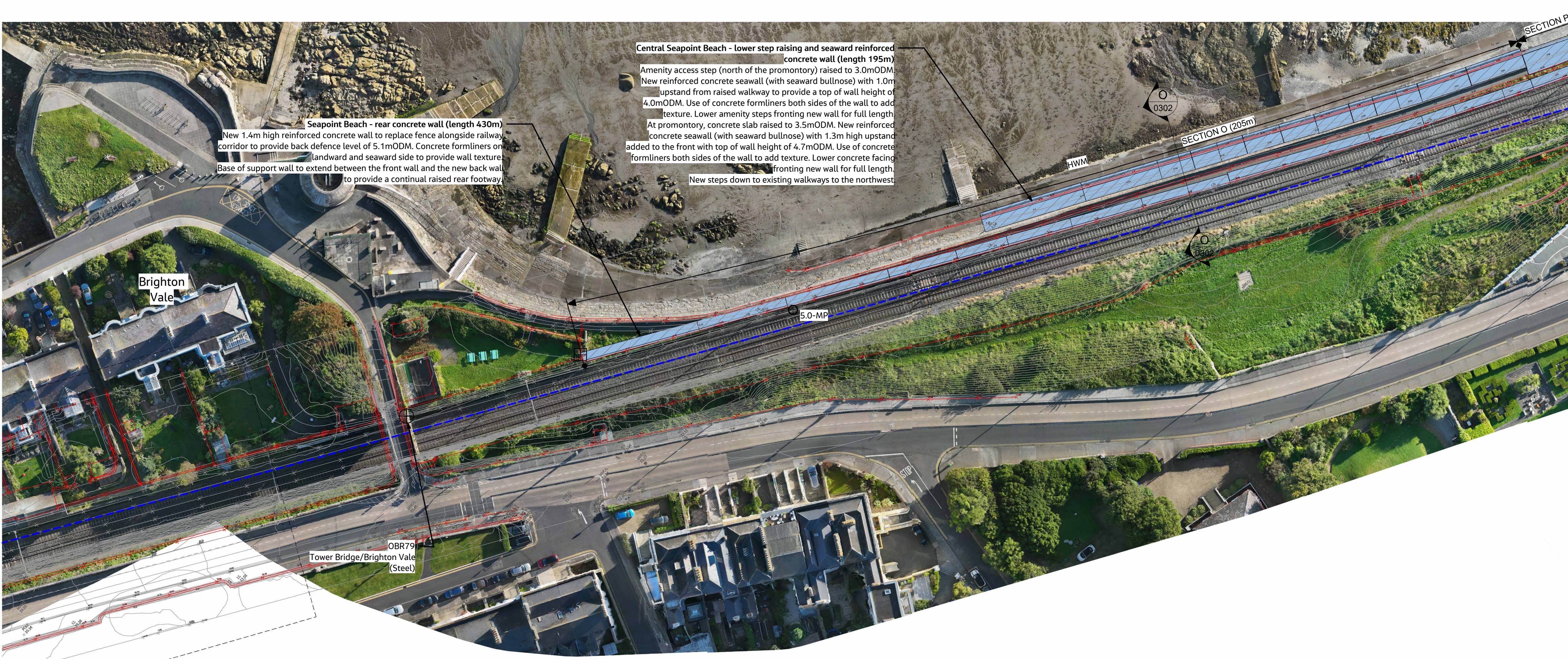
CCA1 - PLAN - PART 12 SCALE 1 : 500