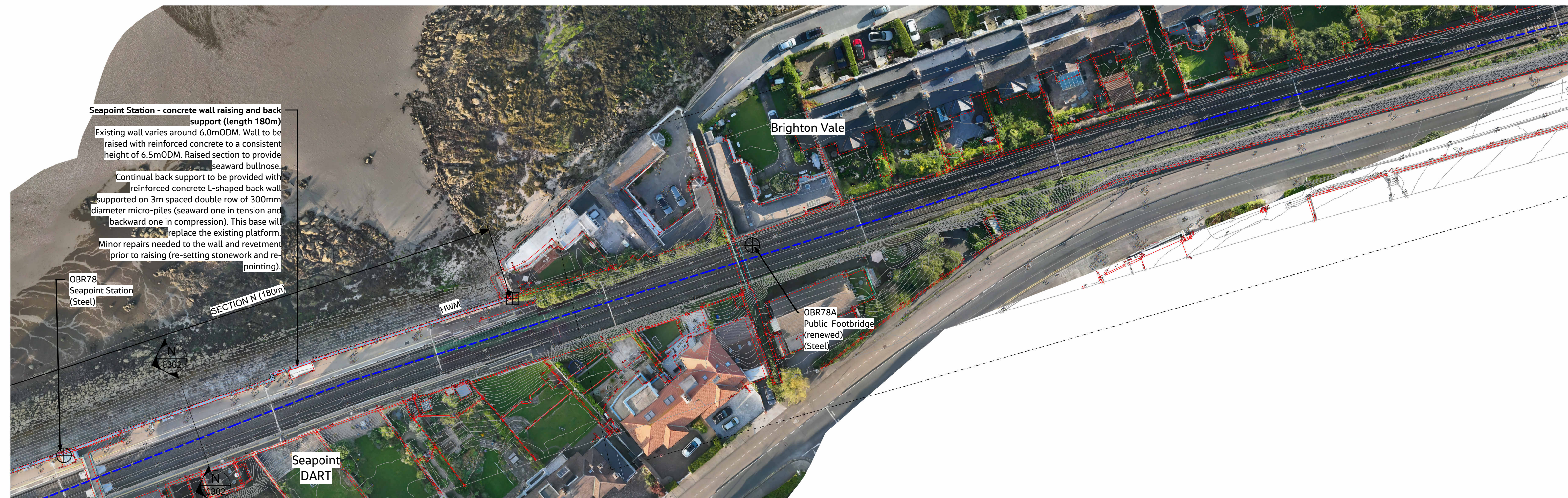
CCA1 - PLAN - PART 11 SCALE 1 : 500