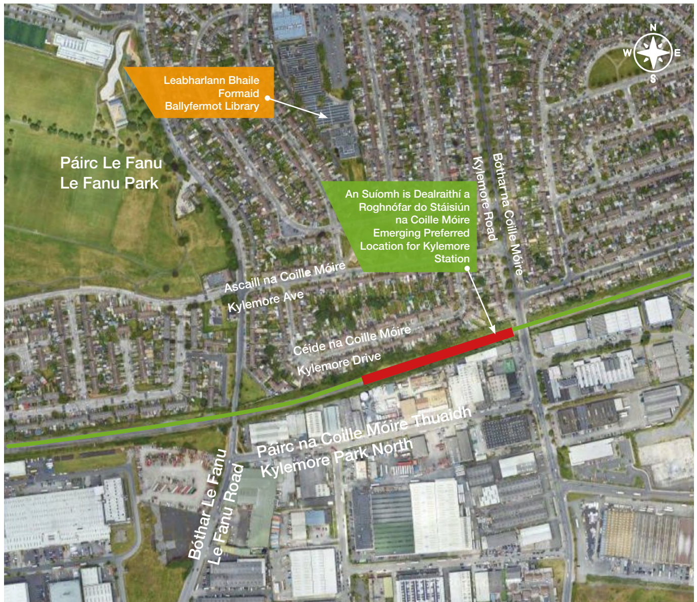
Kylemore Station Location Map

The emerging preferred option for the new station will be located to the west of Kylemore Road Bridge. There is a residential area, Ballyfermot to the north of the rail line and the area to the south is primarily light industrial at present.