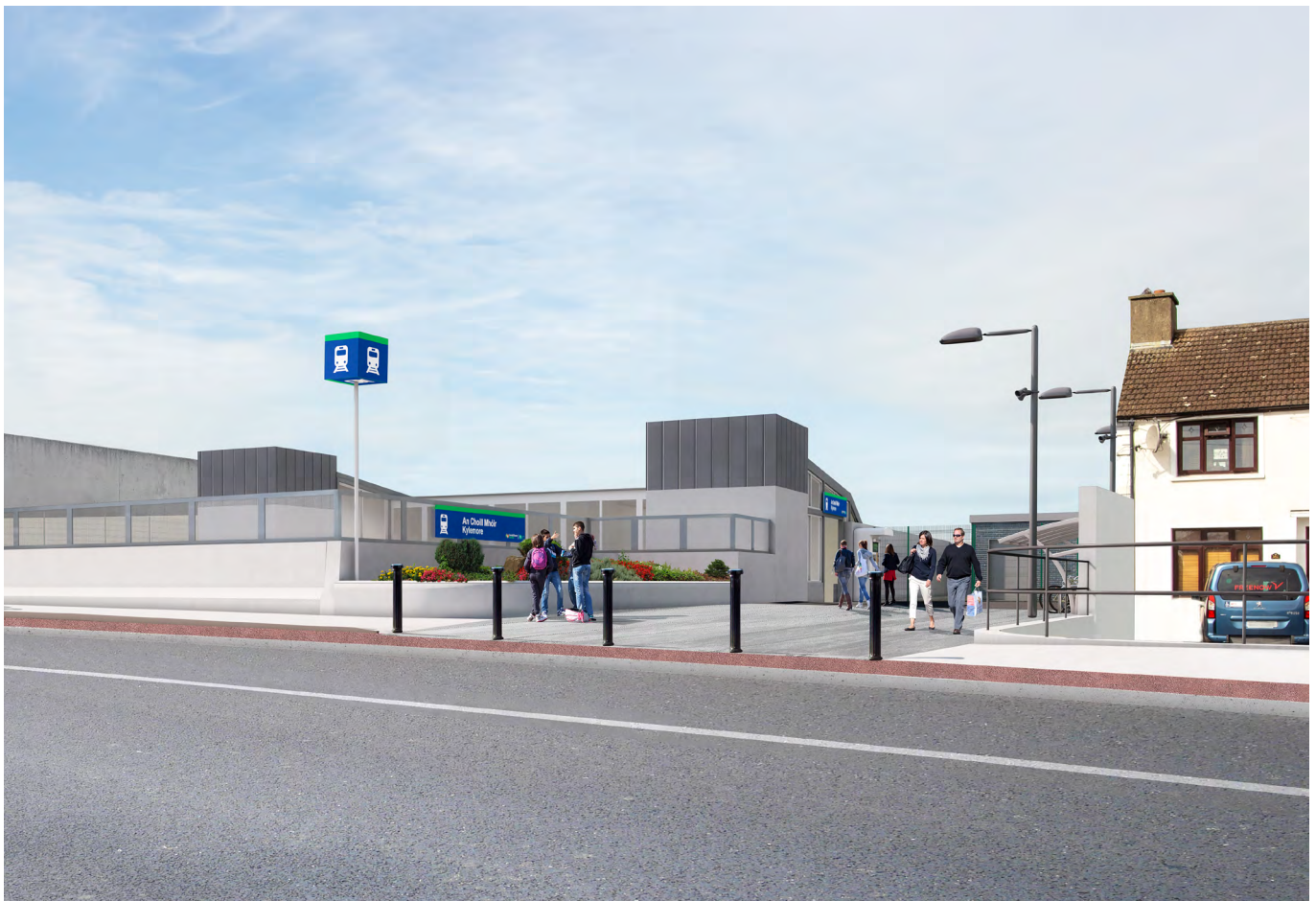
CGI Image Showing The Station Entrance View

Further information on the DART+ Programme can be found at: www.dartplus.ie