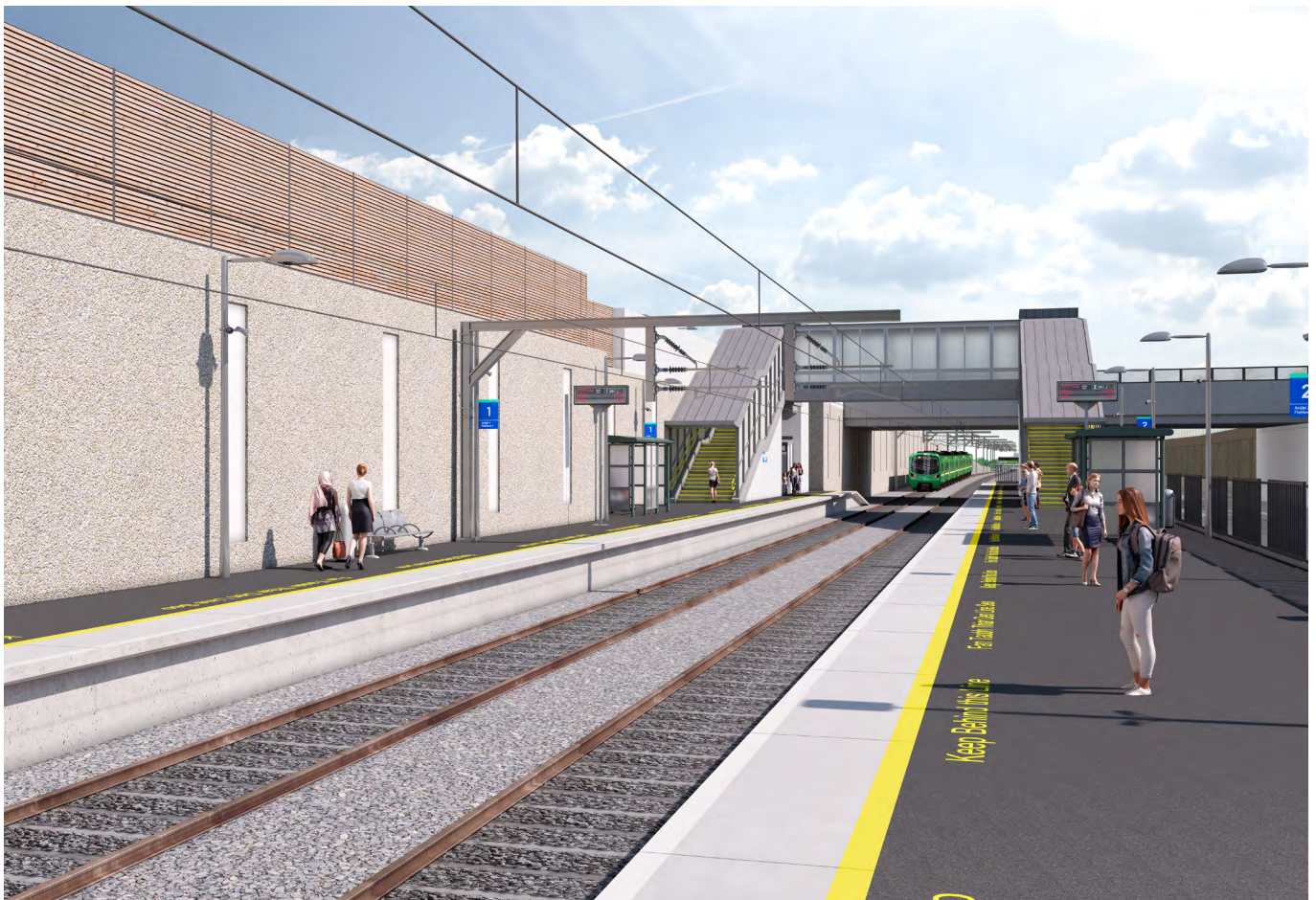
CGI Image Showing A Platform View